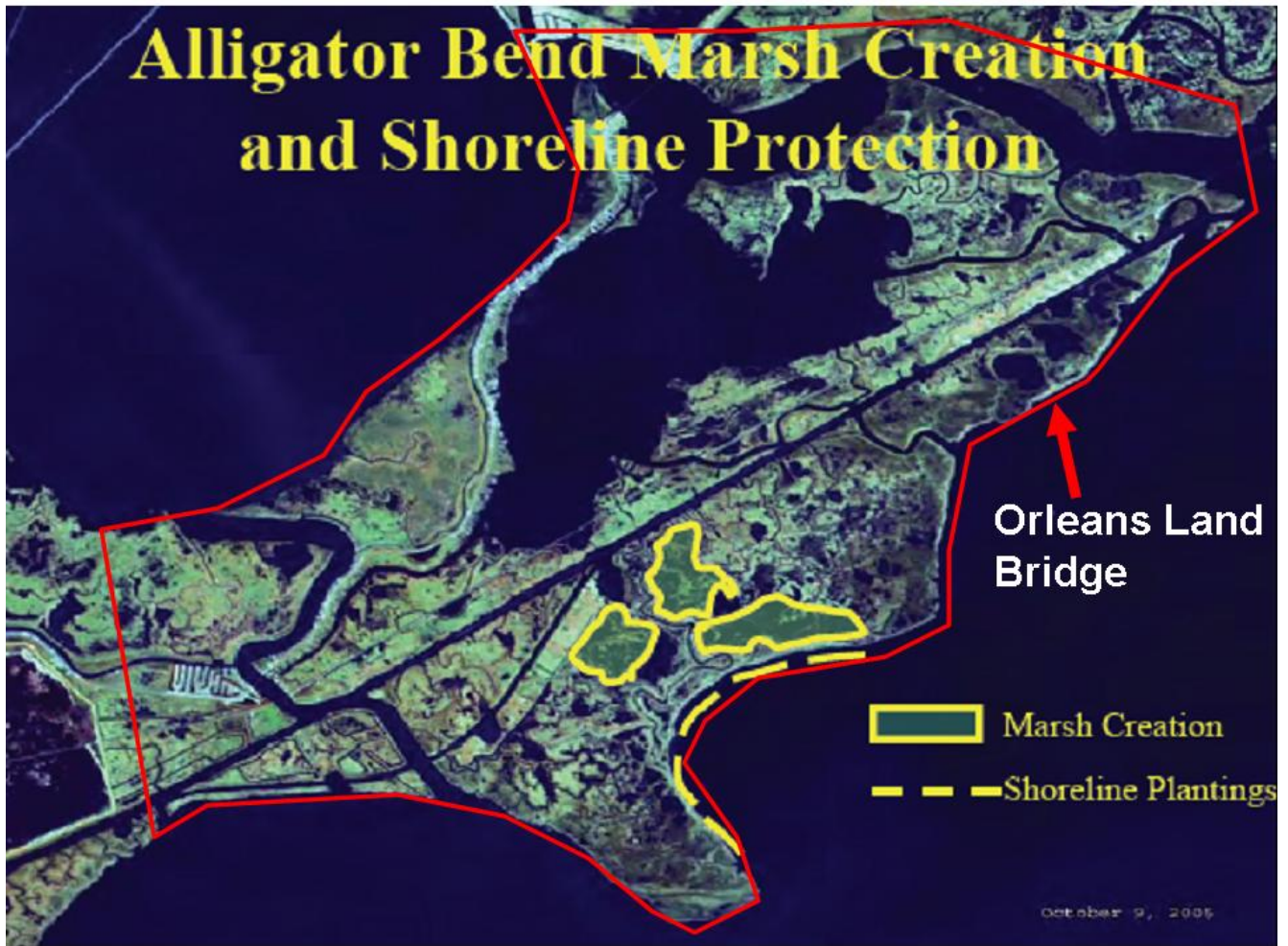
Figure 2: Orleans Land bridge and the Alligator Bend Marsh creation and shoreline protection project. Project is currently being evaluated under CWPPRA for PPL 16. The project would restore marsh loss by Hurricane Katrina and help maintain the integrity of the land bridge of paramount significance to the region.