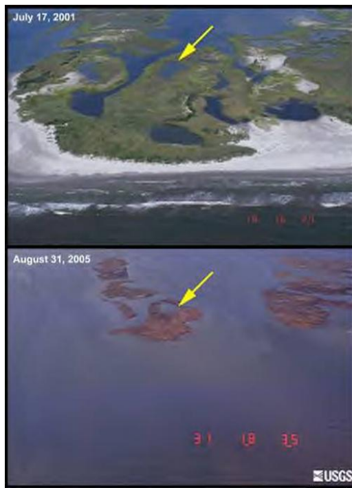
Oblique aerial photographs of a segment of the Chandealeur Islands in the easternmost area of the Pontchartrain Basin in southeastern Louisiana.

Arrows mark a common referenced location. The Chandealeur Islands are part of the Breton Island National Wildlife Refuge established by President Teddy Roosevelt in 1904. The islands normally function as a major bird rookery, which provides critical habitat for several endangered species.